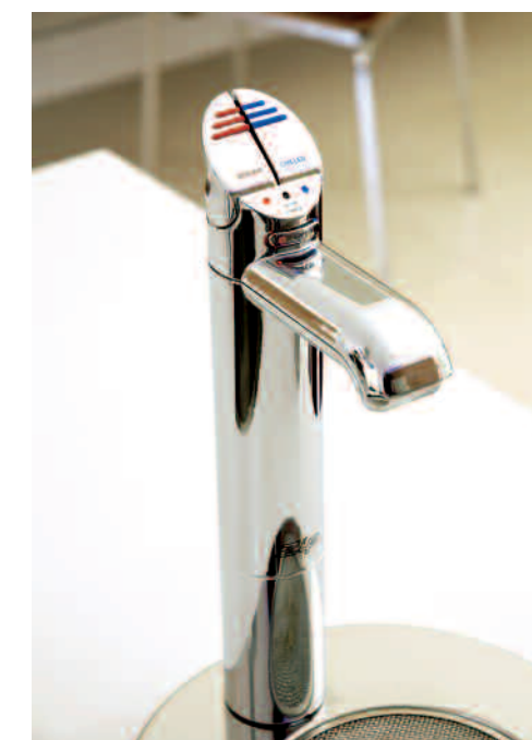
below The Zip Hydro tap serves both boiling and filtered chilled water – great for filling pans or cold refreshment during the warmer summer months.

"They were looking for something that was quite classic, but with a contemporary edge."