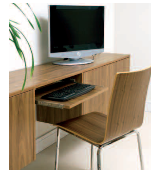
above The desk comprises a keyboard platform that can be easily pushed in when it's not needed.